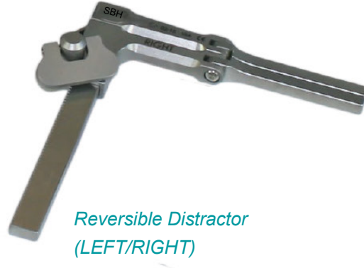
Reversible Distractor (LEFT/RIGHT)