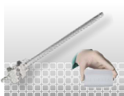
Table Clamp -code GT01 inc 10 Teflon Insulators -code TE01