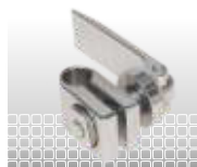
Grip Clamp -code EC05