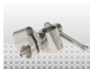
Bariatric Coupling Clamp -code BC01