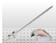
Table Clamp -code GT01 inc 10 Teflon Insulators -code TE01