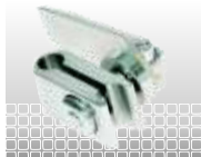
Easy Clamps -code EC01 (Metric) -code EC03 (Imperial)