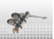
Coupling Clamp -code CC01

Blades - complete range available - refer to Blades Brochure