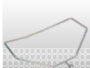
Urologic Ring -code UA01 (Metric) -code UA01I (Imperial)