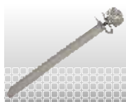
Thyroid - Side Arm -code THSA-01