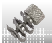
Thyroid Coupling Clamp -code TC01

Blades - complete range available - refer to Blades Brochure